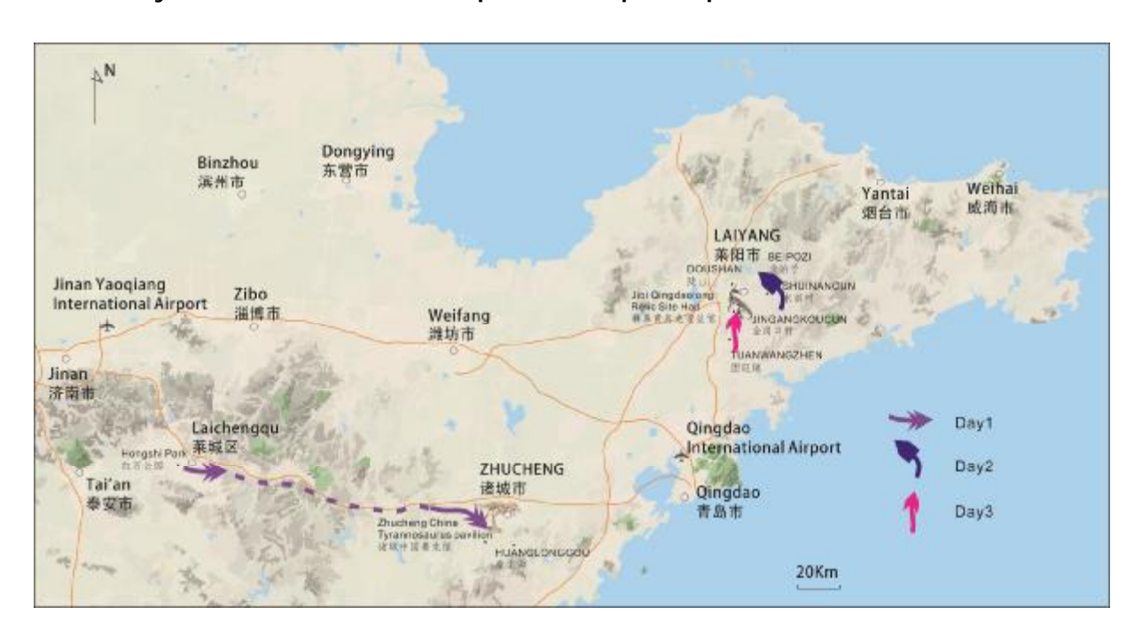
Figure 3. Pre-symposium field excursion plan and visiting localities

Thursday, October 17, 2019 – Departure of participants.