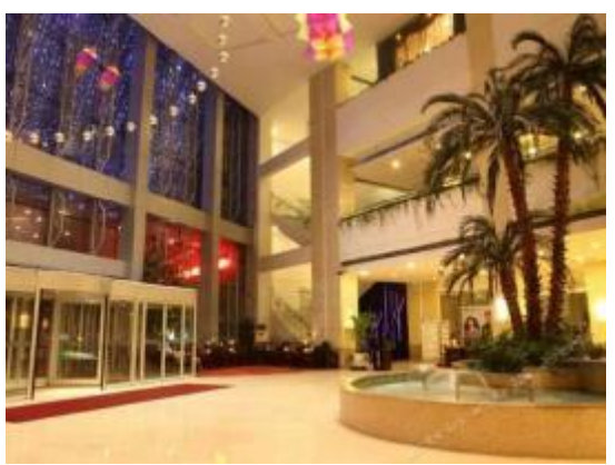
Figure 2. Blue Horizon Hotel (黄岛蓝海大饭店)

Organization committee has reserved rooms for participants who need hotel rooms. We will stay in the same hotel (Qingdao Blue Horizon Hotel 黄岛蓝海大饭店) during the period of the Pre-symposium field trip and the